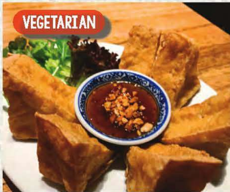
4. TAO HOO TOD (6PC) $9.90 DEEP FRIED TOFU SERVED WITH CHILLI SAUCE