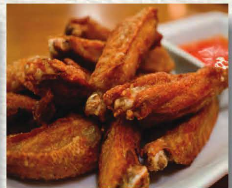
9. CRAZY WINGS (8PC) $14.50 DEEP FRIED CHICKEN WINGETTES CUT INTO PIECES