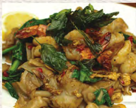
23. PAD KEE MAO STIR FRIED RICE NOODLE WITH CHILLI BASIL SAUCE