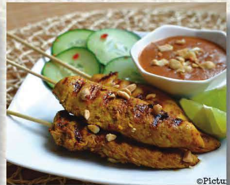
6. CHICKEN SATAY (3PC) $11.90 SERVED WITH PEANUT SAUCE & TOASTED BREAD