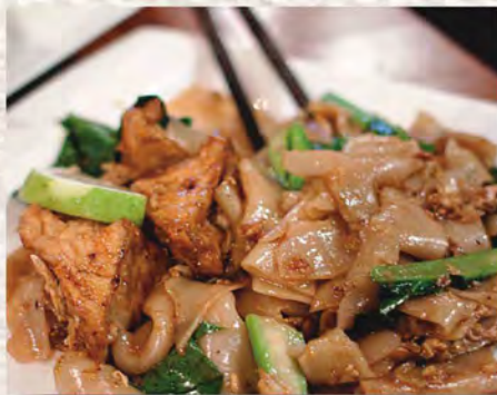
21. PAD SEE EW STIR FRIED FLAT RICE NOODLE WITH SWEET SOY SAUCE