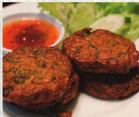
8. FISH CAKE (4PC) $10.90 FRIED MARINATED MINCED FISH IN THAI HERBS, SERVED WITH SWEET CHILLI SAUCE