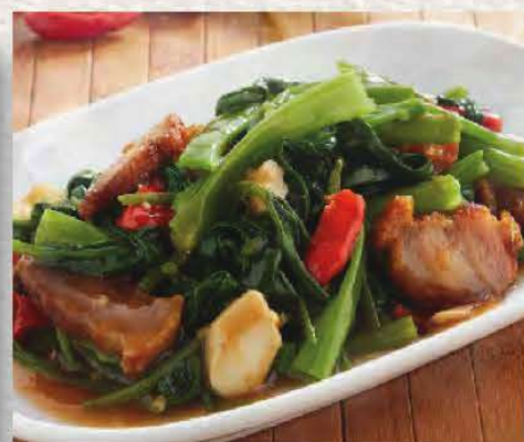
20. PAD PUK BONG $23. 50 CRISPY PORK BELLY STIR FRIED WITH MORNING GLORY / WATER SPINACH