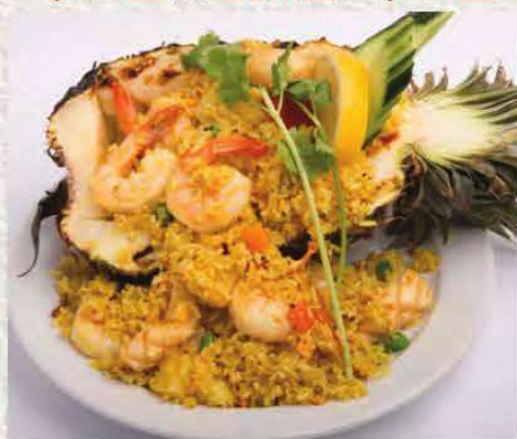
18. KHAO PAD SUB PA ROD $29. 90 PINEAPPLE FRIED RICE WITH SEAFOOD SERVED IN A PINEAPPLE