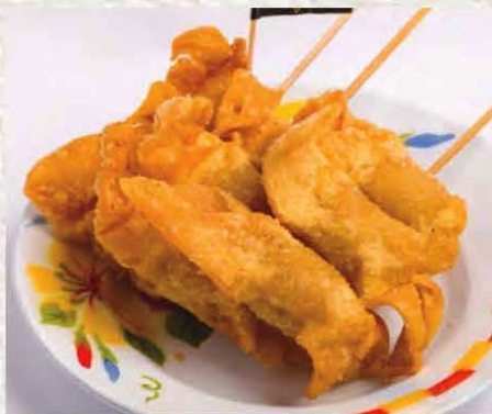
7. KIEW LOOK CHIN TOD (3PC) $7.90 DEEP FRIED WONTONS FILLED WITH PORK BALL SERVED WITH SWEET CHILLI SAUCE