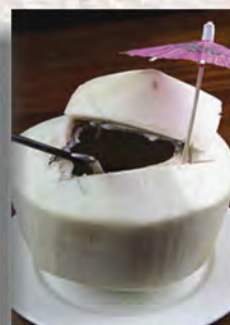
30. WHOLE COCONUT $9.90