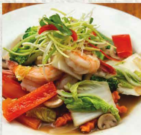
15. OYSTER SAUCE PRAWN