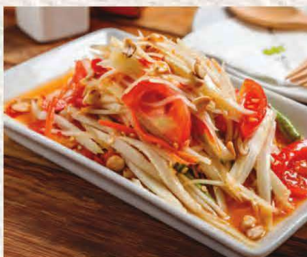
10. SOM TUM THAI $17.50 PAPAYA SALAD WITH PEANUT & DRY SHRIMP