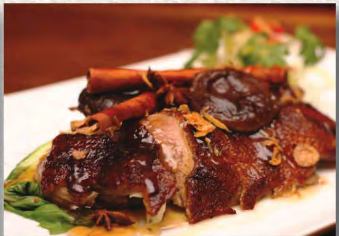
3. PED NAM BUOY $31.50 ROASTED DUCK SERVED WITH STIR FRIED SHITAKE MUSHROOM