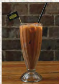
26. THAI MILK TEA $7.50