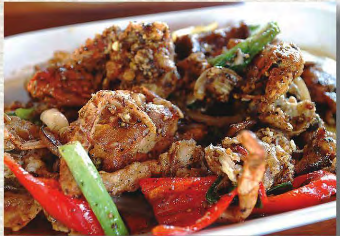
1. GARLIC & PEPPER SOFT SHELL CRAB $28.90 SOFT SHELL CRAB STIR FRIED IN GARLIC & PEPPER SAUCE