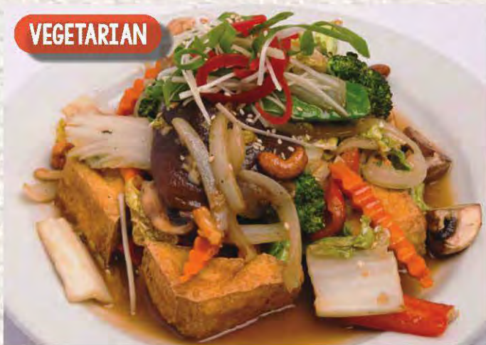
2. STIR FRIED HEALTHY SHITAKE MUSHROOM $24.90 VEGETARIAN DELIGHT, SHITAKE MUSHROOM, TOFU, CAPSICUM STIR FRIED WITH CASHEW NUT & SOYA SAUCE