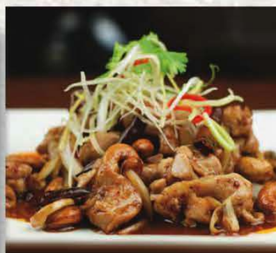
13. CASHEW NUT CHICKEN