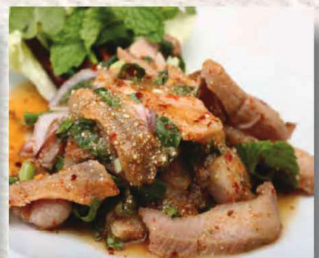
12. BEEF SALAD $23.00 PORK/BEEF SALAD WITH THAI HERBS & DRESSING