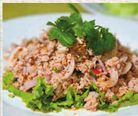
11. LARB KAI $20.90 CHICKEN MINCED, SALAD WITH THAI HERBS