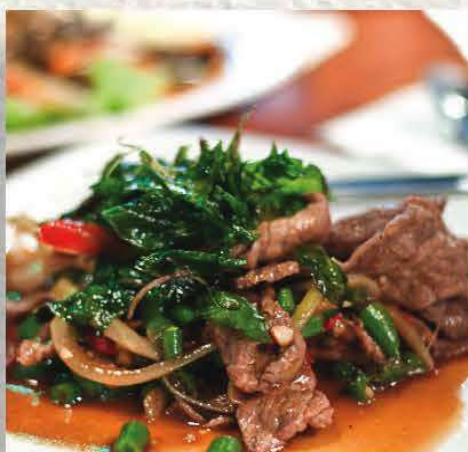
16. CHILLI BASIL BEEF