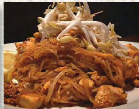
22. PAD THAI STIR FRIED THIN RICE NOODLE WITH PAD THAI SAUCE & DRY SHRIMPS