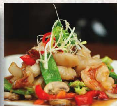
14. GARLIC & PEPPER PRAWN