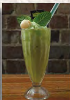
28. LYCHEE MINT $8.90