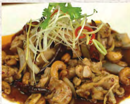
24. PAD MED MA MUANG STIR FRIED FLAT RICE NOODLE WITH CASHEW NUTS & CHILLI JAM SAUCE