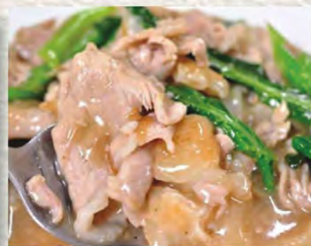
25. RAD NA STIR FRIED FLAT RICE NOODLE IN GRAVY SAUCE