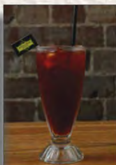
27. THAI LEMON ICE TEA $7.50