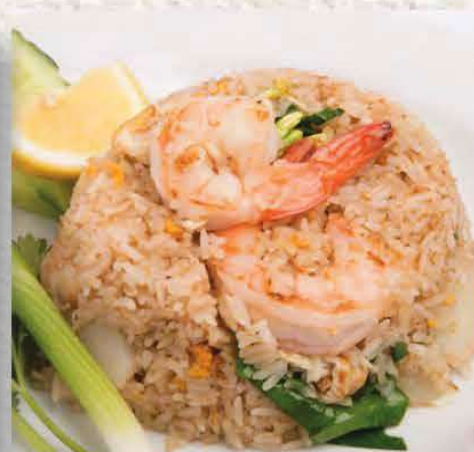
17. CHILLI BASIL BEEF