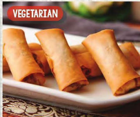
5. SPRING ROLL (8PC) $9.90 CRISPY VEGETARIAN SPRING ROLL, SERVED WITH PLUM SAUCE