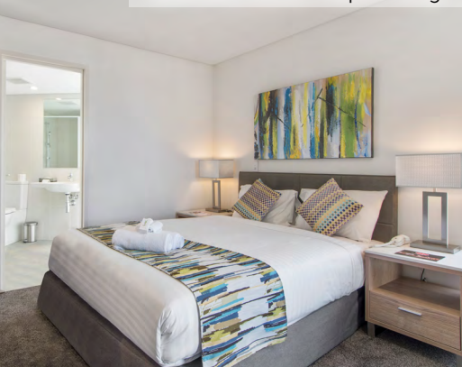
Executive Room - Aspire Wing